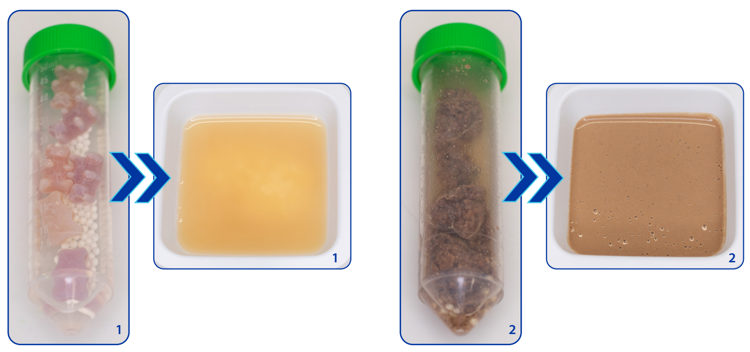
Figure 3. Image of Gummy Bear<sup>1</sup>, and Brownie<sup>2</sup> samples before and after homogenization