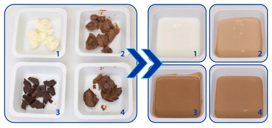
Figure 2. White Chocolate Ball<sup>1</sup>, Milk Chocolate Ball<sup>2</sup>, Chocolate Bar with Caramel Inclusions<sup>3</sup>, and Dark Chocolate Ball<sup>4</sup> samples before and after homogenization.